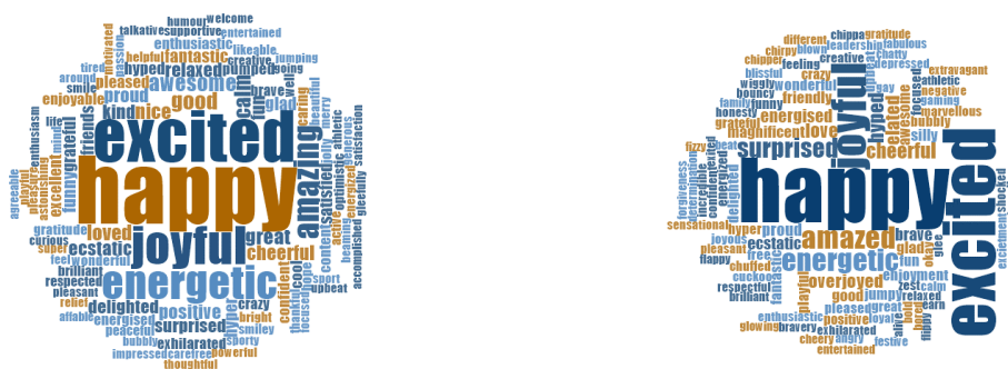
Figure 2. Student pleasant high energy emotion vocabulary pre- (left) and post- (right) results.